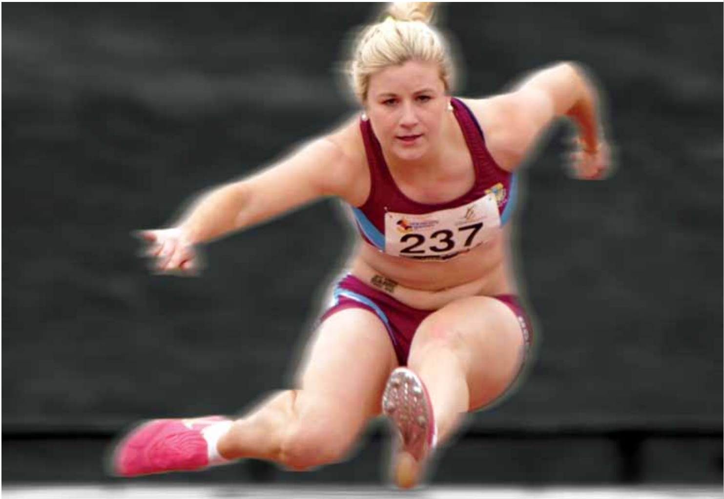
Women's 100m hurdles 2011 Australian University Games, Gold Coast