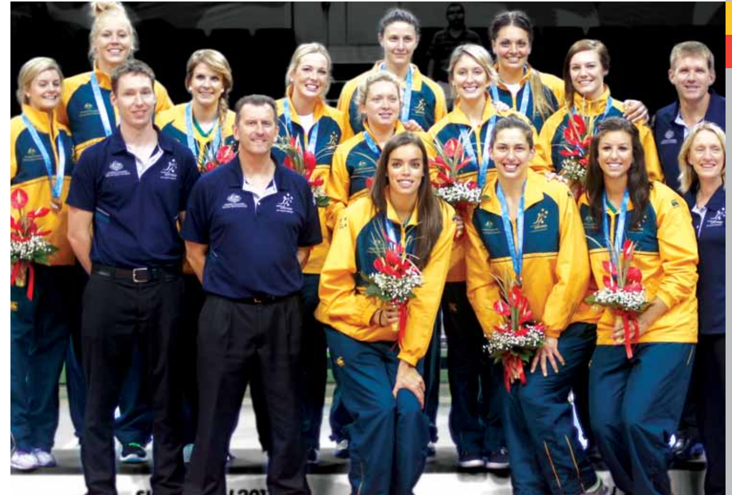
2011 Summer Universiade, Shenzhen China, 11-23 August Australian Unirooms Women's Basketball Team Bronze medallists