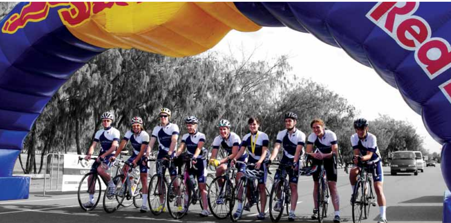
Monash University Cycling Team 2011 Australian University Games, Gold Coast.

The Red Frogs Crew provided participants across all AUS multi sport events with hydration stations and snacks at a marquee set up each night alongside the social program venues. They also operated a 1300 number that students could call to request a walk home service to escort them home safely or to get assistance in the event that they or their friends required assistance to get home safely. Red Frogs also took part in the breakfast event that was held on the Tuesday of AUG where they did a pancake cook up to compliment the Ice Break sampling at the Transit Centre Games transport hub.