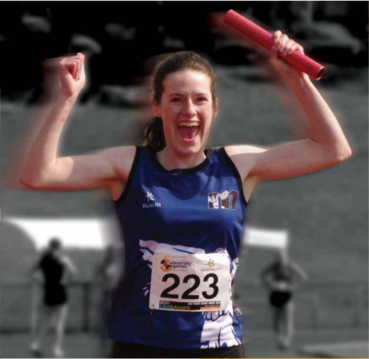
2011 Australian University Games Melbourne University Relay Team