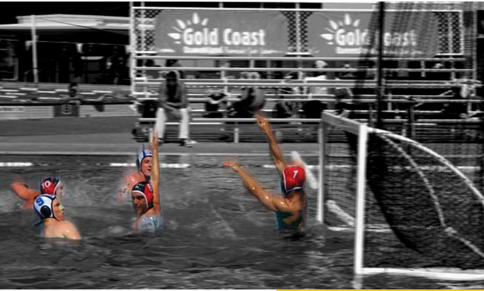
2011 Australian University Games Water Polo

Under the new pennant count system, The University of Sydney were awarded the title of overall champion university. Bond University were winners of the Doug Ellis Trophy for points per capita and Murdoch University were awarded the John White Memorial Spirit of the Games Award.