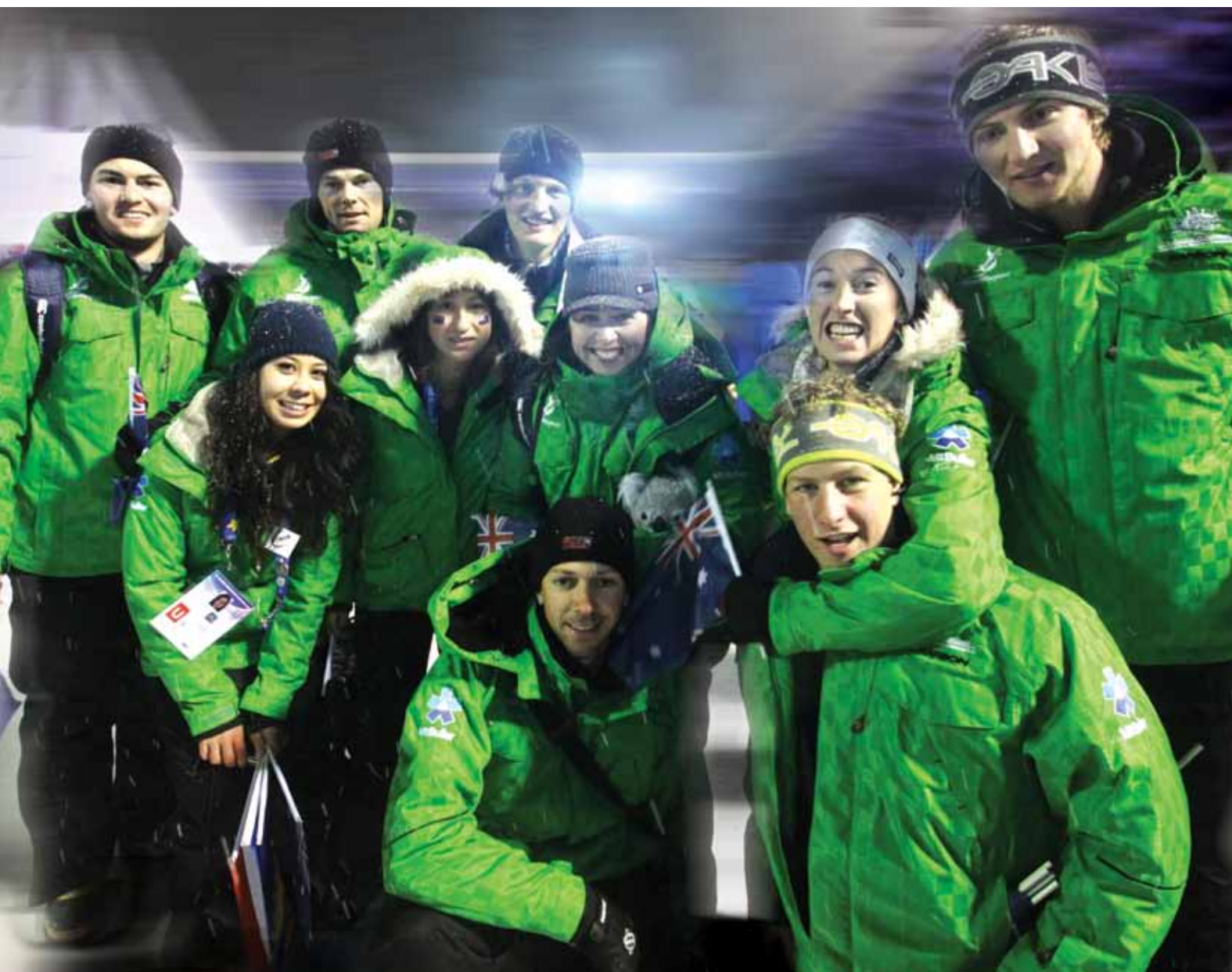
2011 Uniroos Winter Universiade, Erzurum, Turkey Australian team at the Opening Ceremony

Thanks and recognition must go to the national sporting organisations and suppliers, without whose support the team's success would not have been possible.