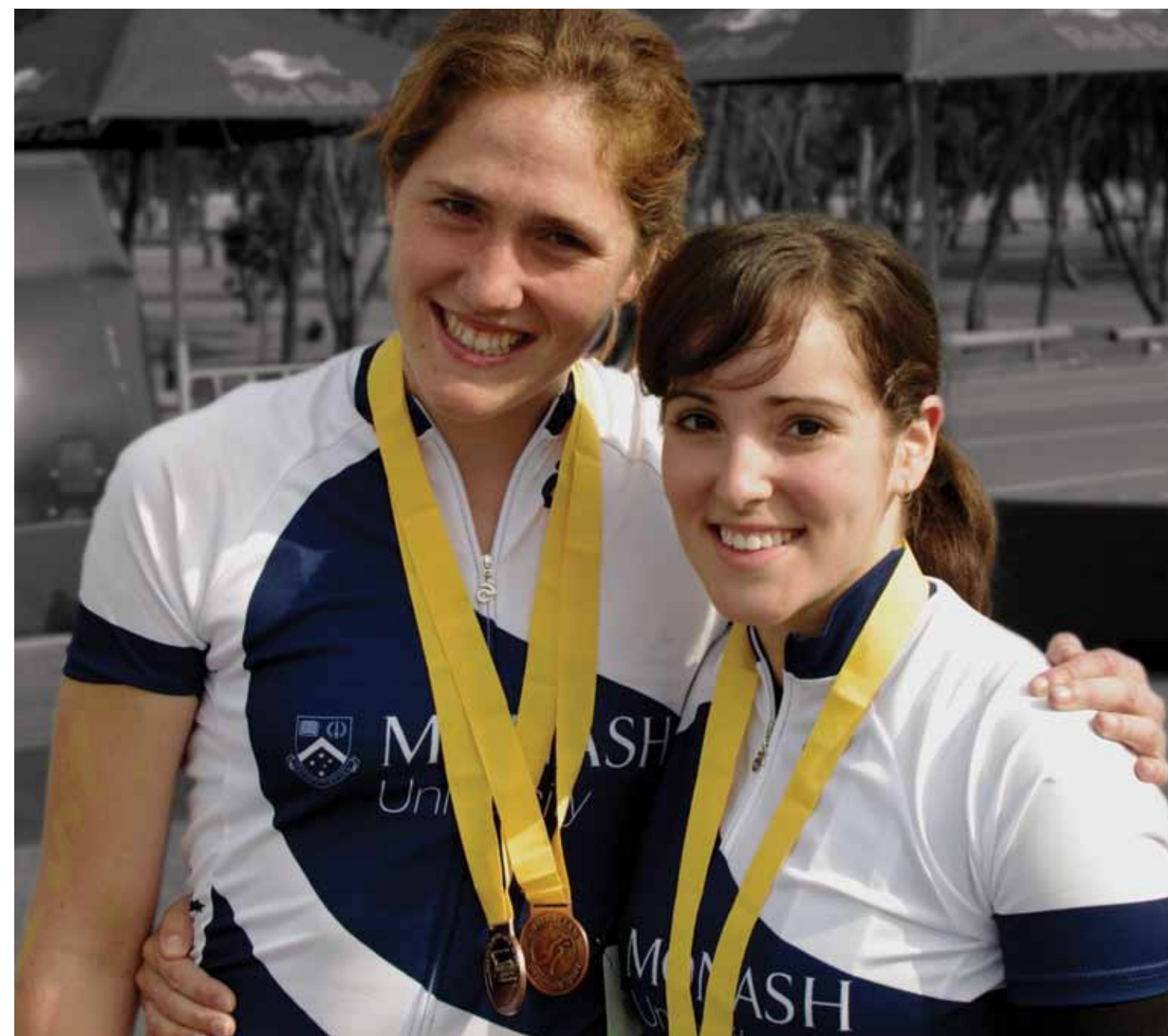
Monash University, 2011 Australian University Games Medalists.