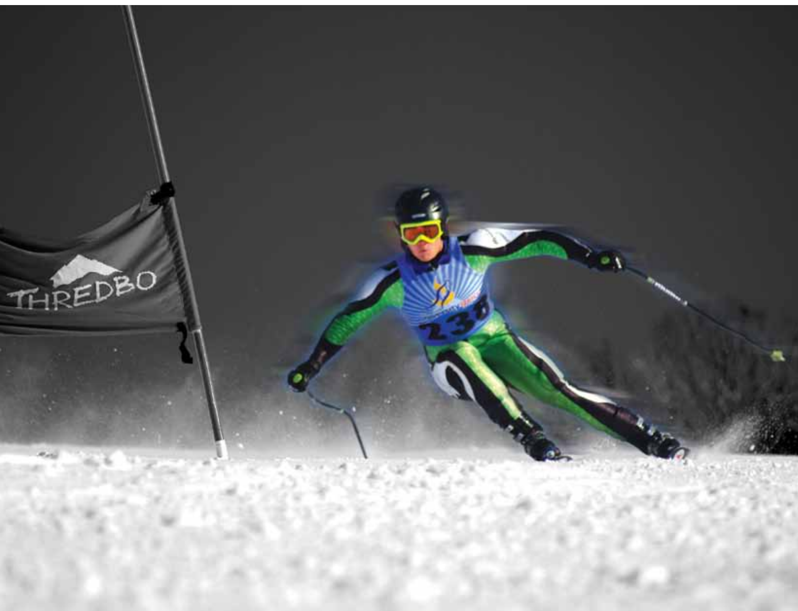
2011 Australian University Championship Snow Sports