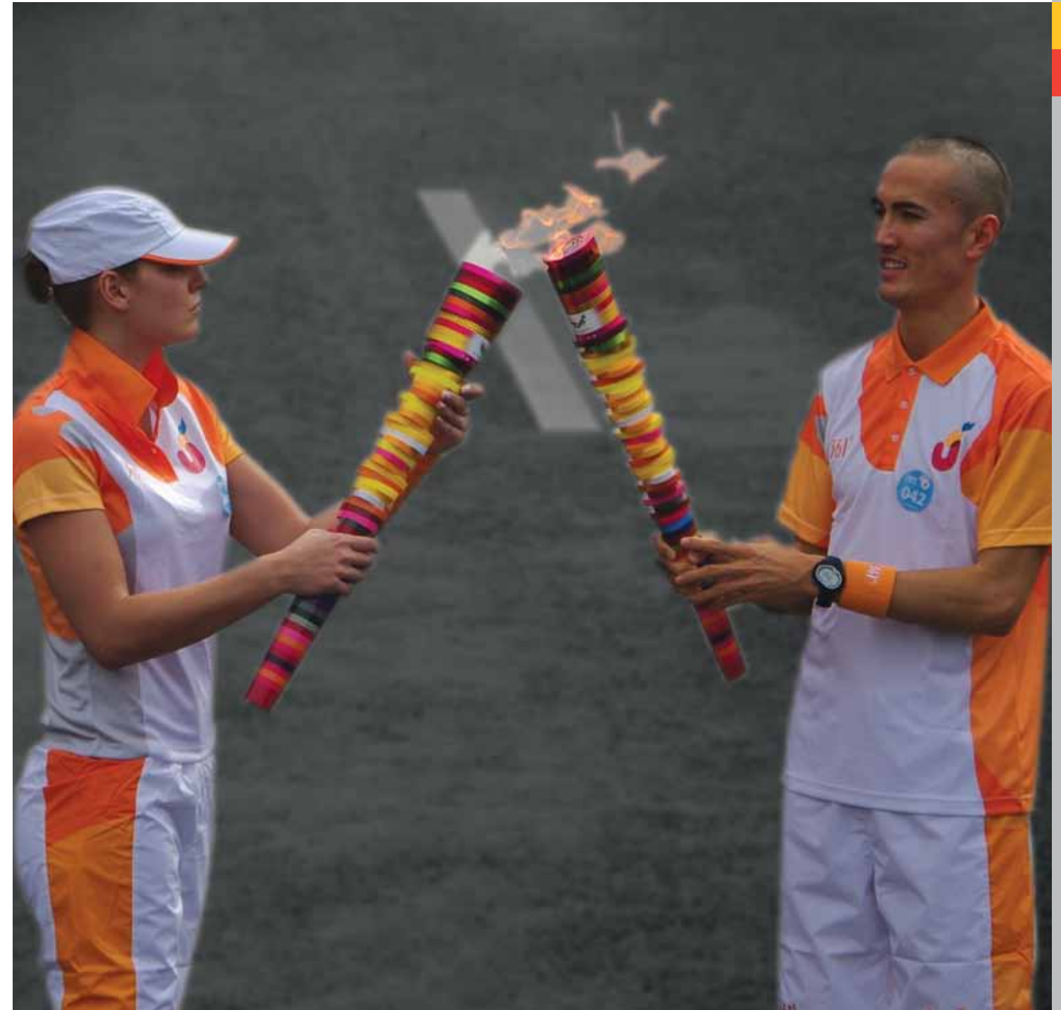
2011 Uniroos Summer Universiade, Shenzhen, China Torch Relay