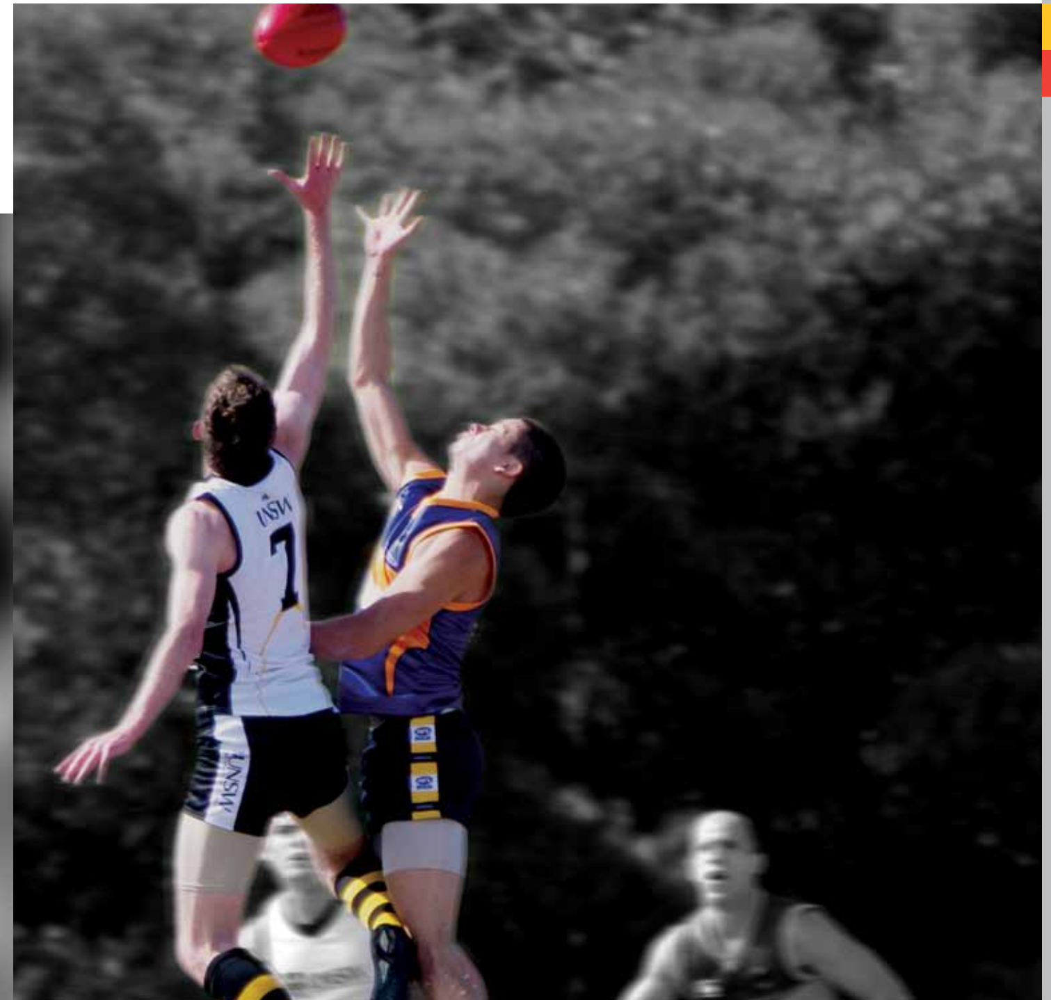
2011 Australian University Games AFL