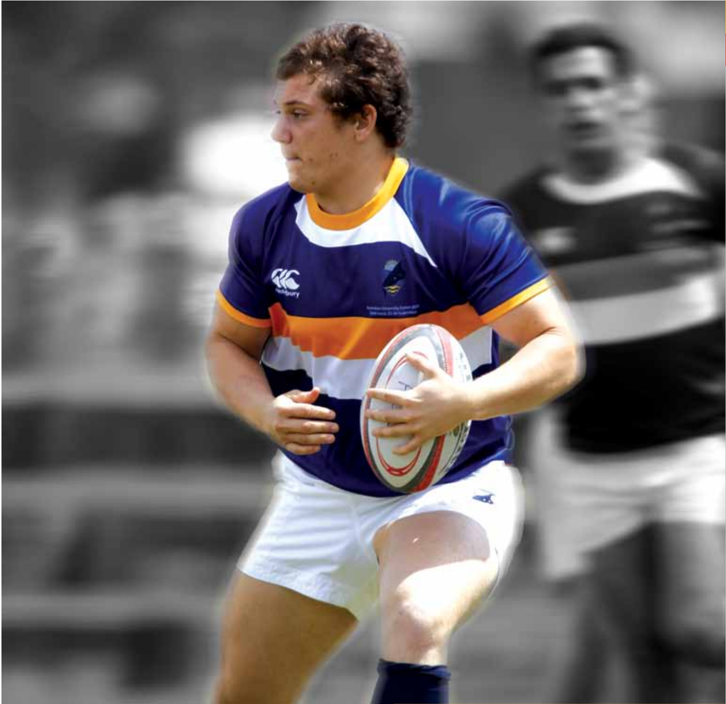
Bond University, 2011 Australian University Games Rugby 7's Competition