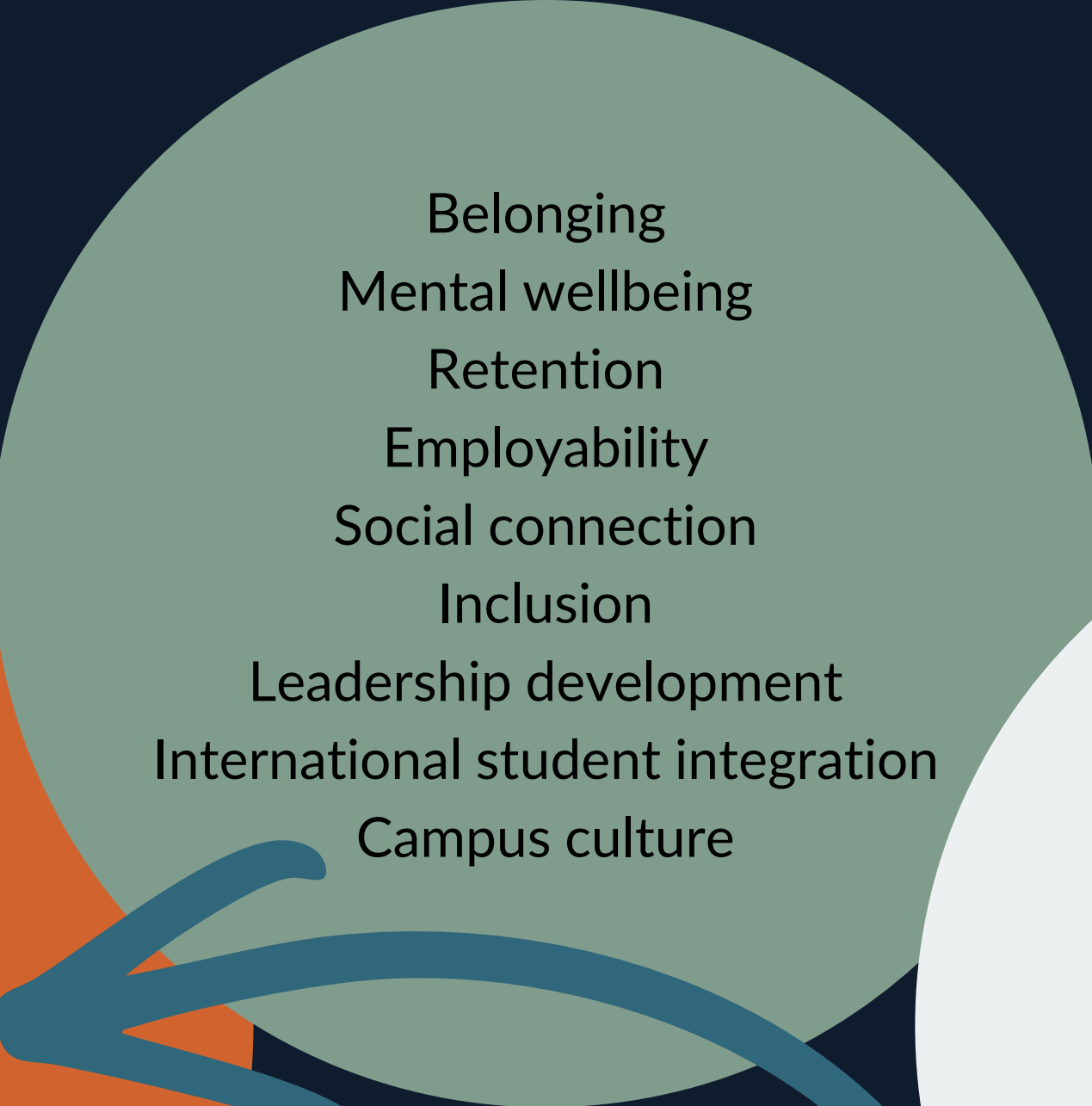
The Value of Sport