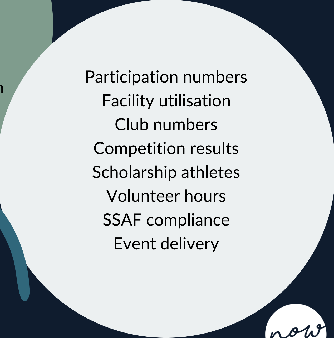
Sport Dept KPIs