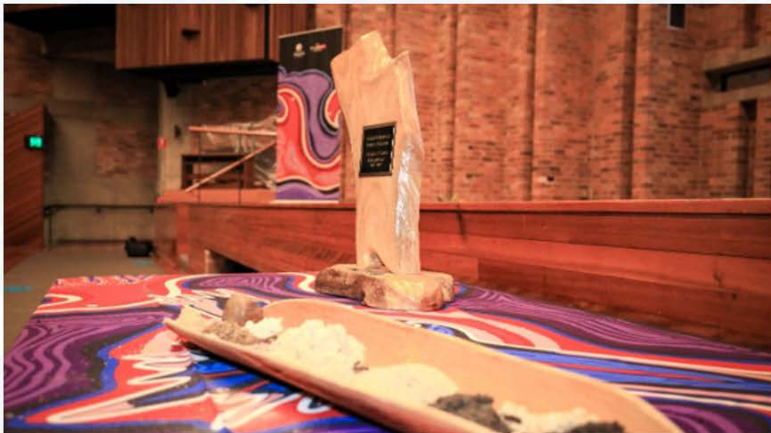
Coolamon and Official National Tertiary Education Student Games Overall Trophy.